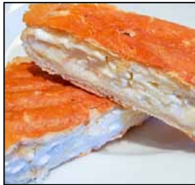
Formaggio $5 00 Double mozzarella melted between flattened round bread