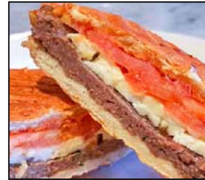
Giuseppe Jr. $7 00 Hamburger, mozzarella, ketchup and tomato on round bread