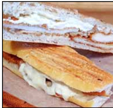
Erika $8 00 Chicken cutlet, mozzarella on rustic hero