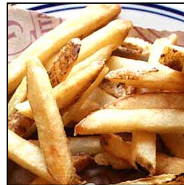
Patatine Fritte $5 00 Side of Tuscan fries