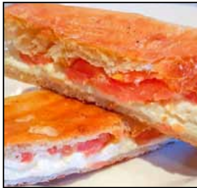
Mattia $5 00 Mozzarella, tomato, basil on rustic hero