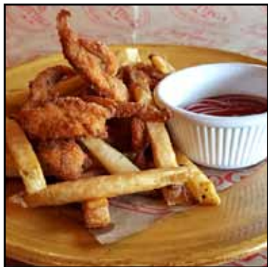
Pollo Con Patatine $8 50 Chicken strips with a side of Tuscan fries