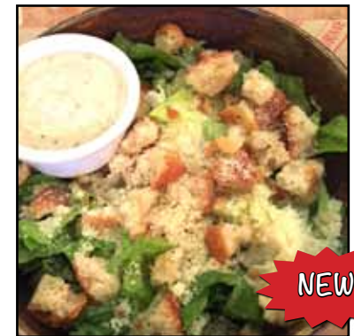
Jr. Caesar $4 50 Romaine hearts, ciabatta croutons, shaved Parmigiano & Caesar dressing with Chicken $6 00 (grilled or cutlet)