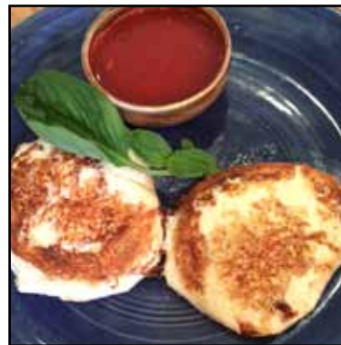
Pan Seared Mozzarella $6 50 Fresh Homemade Mozzarella with tomatoes dressing and basil drizzled with balsamic