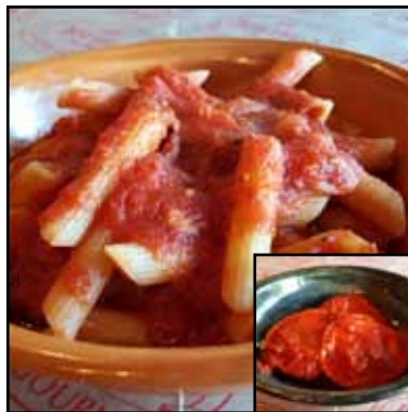
Penne $8 00 or Raviolini $9 00 Pasta with choice of marinara, garlic & oil, or butter sauce